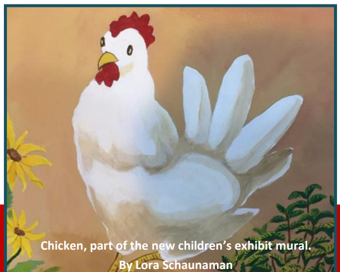
Chicken, part of the new children's exhibit mural.