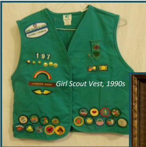
Girl Scout Vest, 1990s