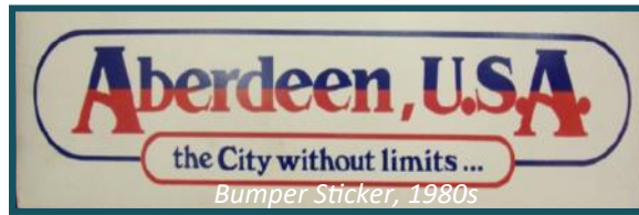
the City without limits ... Bumper Sticker, 1980s