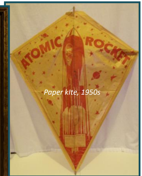
Paper kite, 1950s