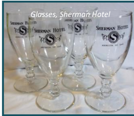
Glasses, Sherman Hotel