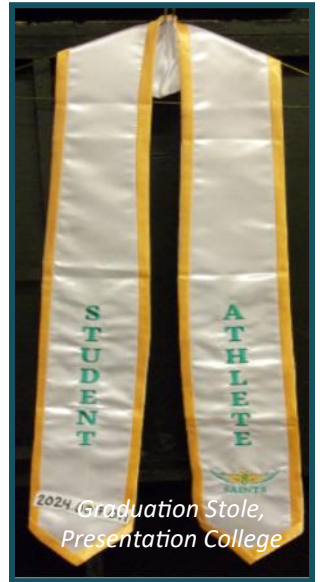
2024 Graduation Stole, Presentation College