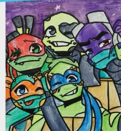
BETTER TIMES CONNIE REED