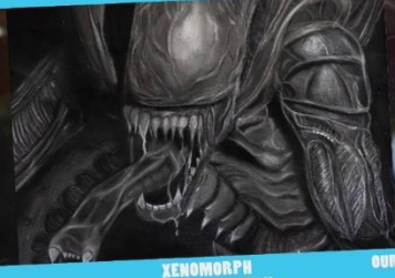
XENOMORPH LAILA MIDDLETON