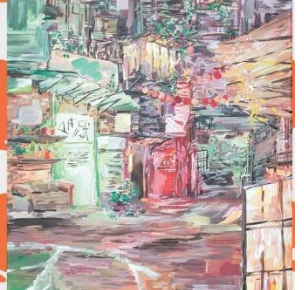
CITY I NOELLE RAU

LUNCH HOUR OPEN GALLERY APRIL 17 & 18 11:45AM - 12:45PM