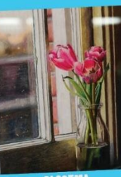
BLOSTMA RACHEL ZIEGLENDORF