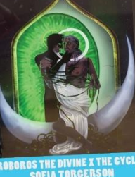
OUBOROS THE DIVINE X THE CYCLICAL SOFIA TORGERSON