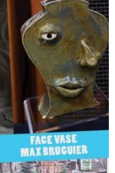
FACE VASE MAX BRUCQUIER